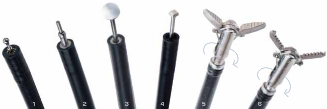
1 Ball Type Knife 2 Cylindrical Type Knife 3 IT Knife 4 Square Knife 5 Dissection Forceps 6 Tooth Type Forceps