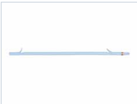
Einweg Gallengangs-Prothese (Stent), gerade, mit Goldring und Einführhilfe Disposable biliary duct stent, straight, with gold marker and insertion aid